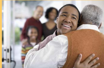
Recognizing the success at

Data from the BSFT™ Redirection site, Crosswinds Youth Services, collected by EBA, shows a 75% successful discharge rate for the report period ending June, 2009. We anticipate the report on one year re-arrest rates from DJJ at the end of 2009 for the first cohort of youth receiving BSFT™ at Crosswinds.