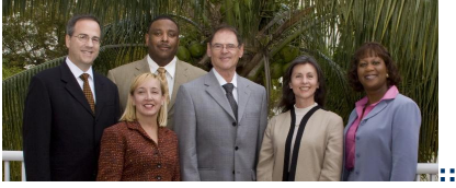
The BSFT™ Leadership Team

Brief Strategic Family Therapy® Institute University of Miami 1425 NW 10 th Avenue Miami, FL 33136 Phone (305) 243-7585 Fax (305) 243-2320 BSFT@med.miami.edu